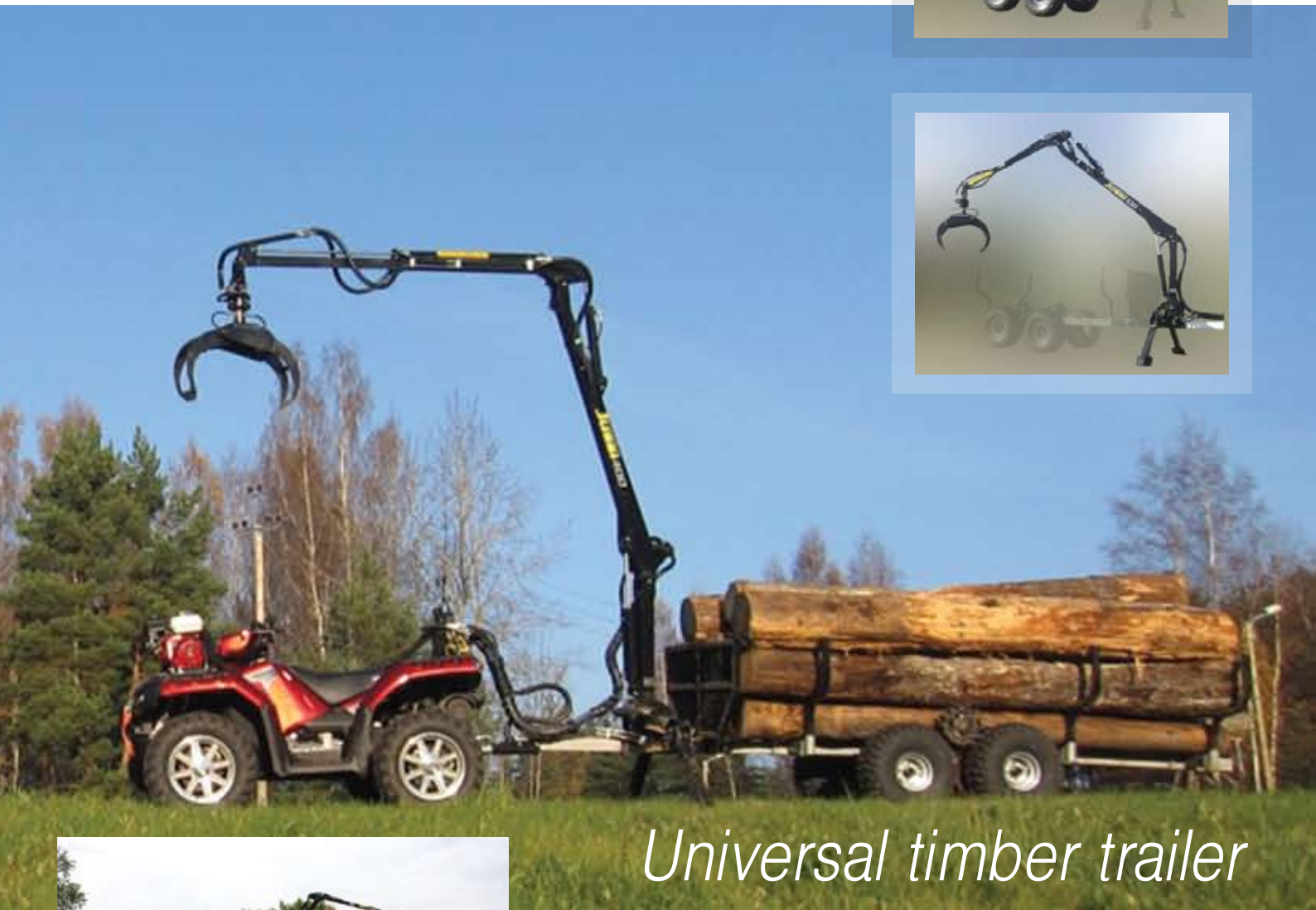
Universal timber trailer